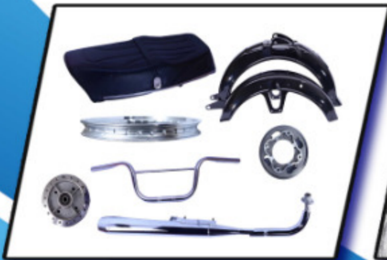
AUTO PARTS MANUFACTURER