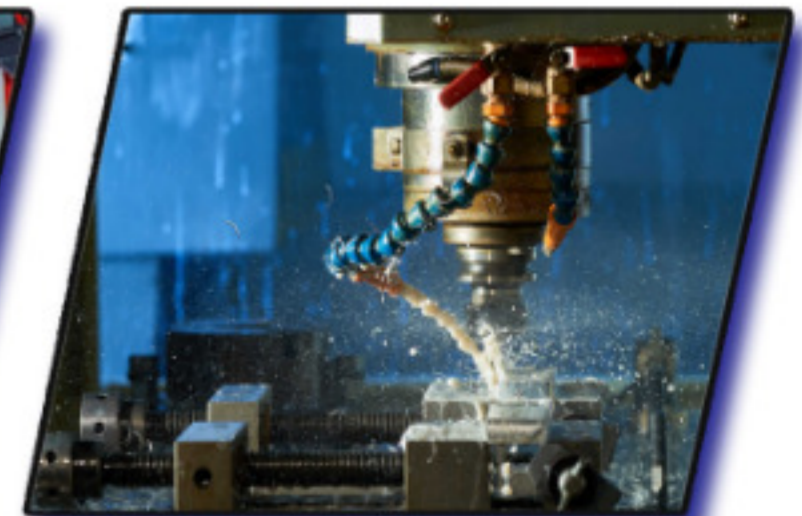
HIGH PRECISION ENGINEERING