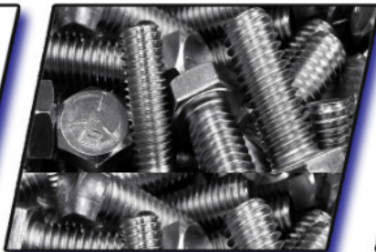
BOLTS & FASTENERS