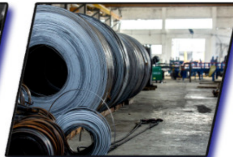
WIRE DRAWING SERVICES